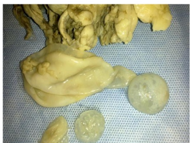
Figure 4 Cut section of the main hydatid cyst with daughter cysts.

show an unruptured cyst appearing as a spherical, wellcircumscribed, homogenous opacity, particularly pronounced if calcified. Blood eosinophilia is reported to occur in 20% to 34% of patients [13]. It is a nonspecific sign because it may be seen in numerous other pathologies. A higher rate of eosinophilia was found in patients with ruptured cysts [14]. The serological tests including Casoni intradermal skin test, Weinberg complement fixation (CF) test, indirect hemagglutination (IHA) test, ELISA, and western blot (WB) are the frequently used laboratory tests for diagnosis of hydatid disease, with the reported sensitivity of 96.7%, 87.1%, and 100%, for IHA, ELISA, and WB, respectively [15]. Patients with a liver cyst are reported to have a higher rate of serologic test sensitivity than those having extrahepatic disease [16]. The serological tests are complementary to clinical and radiologic findings and can also be used in the follow-up of patients after surgical resection [17].