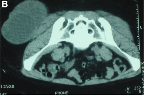
Figure 2 (A and B) Computed tomography; Parasagittal and axial view of the pelvis showing a cystic mass involving the right gluteus medius measuring 5x6cm with multiple daughter cysts inside the parent lesion.