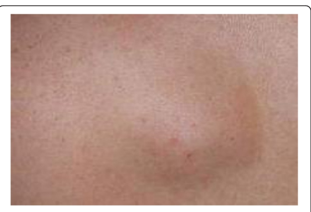
Figure 1 Preoperative view of the lump in the right buttock.

months to prevent recurrence. The patient had an uneventful recovery and was discharged home in a satisfactory condition.