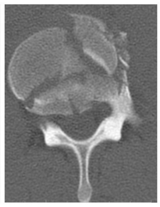
Figure 1 Preoperative computed tomography imaging. There is a lumbar L4 burst fracture with minimal loss of height and canal compromise

The patient could not benefit from a conservative management trial, including mobilization and physical therapy in a TLSO brace, because any attempts to elevate the head of the bed resulted in excruciating pain at the site of the fracture.