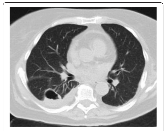
Figure 3 A computed tomography evaluation about one month after admission showed complete resolution of the airfilled cavitary lesion anteriorly. In the area of the contusion, a large thin-walled air cavity displaying an air-fluid level is evident.

TPPs are most often seen in children and young adults, in whom the thorax is elastic, the visceral pleura intact, and the parenchyma easily injured. Around 85% of cases reported in the literature involved patients below the age