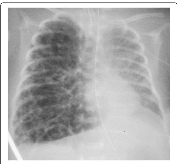
Figure 2 A chest X-ray obtained on postnatal day 11. Diffuse pulmonary interstitial emphysema with growing pseudocystic changes in the right lung field can be seen on this X-ray.

improvement in clinical condition (Figure 4). We used thoracic transillumination to monitor both the effectiveness of evacuation and the development of accidental pneumothorax. The drainage was discontinued 5 days after the lung puncture, and there was no PIE recurrence (Figure 5). After complete resolution of PIE, bilateral bubbling shadows gradually appeared on chest X-rays. Chronic lung disease was diagnosed, and systemic and inhaled steroids were administered. He was weaned from HFO ventilation on day 34 and from ventilatory support on day 68.