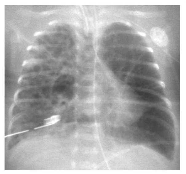
Figure 4 A chest X-ray obtained after lung puncture. Decompression of diffuse pulmonary interstitial emphysema was performed with a trocar catheter. The mediastinal shift improved after decompression.

life-threatening diffuse PIE, who were successfully treated by puncture of the affected lung and drainage of the resulting pneumothorax. Dördelmann et al. [1] reported an ELBW baby (765g) with PIE whose ipsilateral lung was punctured with a pigtail catheter to create and subsequently drain a pneumothorax. Our patient weighed 420g, which, to the best of our knowledge, is the lowest reported birth weight among ELBW babies with PIE.