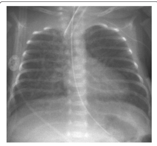
Figure 5 A chest X-ray obtained on postnatal day 37. Almost complete regression of pulmonary interstitial emphysema can be seen.