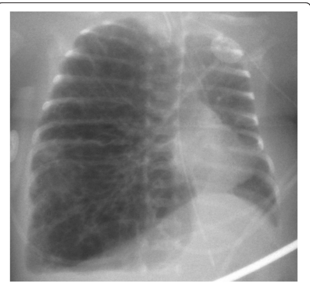
Figure 3 A chest X-ray obtained before lung puncture. The chest radiograph obtained just before decompression shows diffuse pulmonary interstitial emphysema in the right lung and a mediastinal shift to the left.

life-threatening diffuse PIE, who were successfully treated by puncture of the affected lung and drainage of the resulting pneumothorax. Dördelmann et al. [1] reported an ELBW baby (765g) with PIE whose ipsilateral lung was punctured with a pigtail catheter to create and subsequently drain a pneumothorax. Our patient weighed 420g, which, to the best of our knowledge, is the lowest reported birth weight among ELBW babies with PIE.