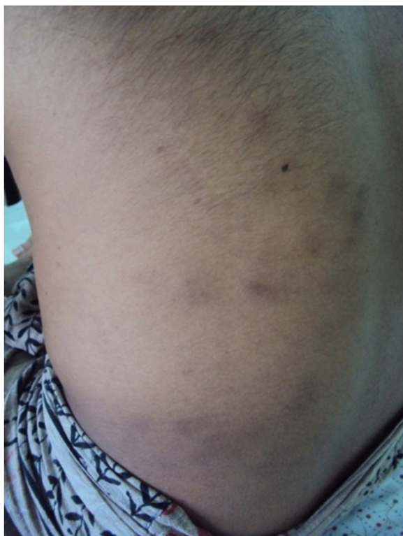
Figure 1 Panniculitic type skin rash with tender hard nodules.