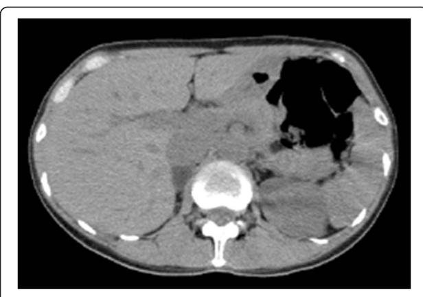
Figure 1 Abdominal computed tomography showing a 19mm right adrenal tumor.

her right and left adrenal vein were found to be 51,900pg/mL and 1,200pg/mL, respectively. Thirty minutes after stimulation with adrenocorticotropic hormone, these levels rose to 113,000pg/mL and 1,5100pg/mL, respectively. The aldosterone-to-cortisol ratio was 340 times higher in her right adrenal vein than in her left adrenal vein. These findings demonstrated that her right adrenal gland was the source of excess aldosterone secretion.