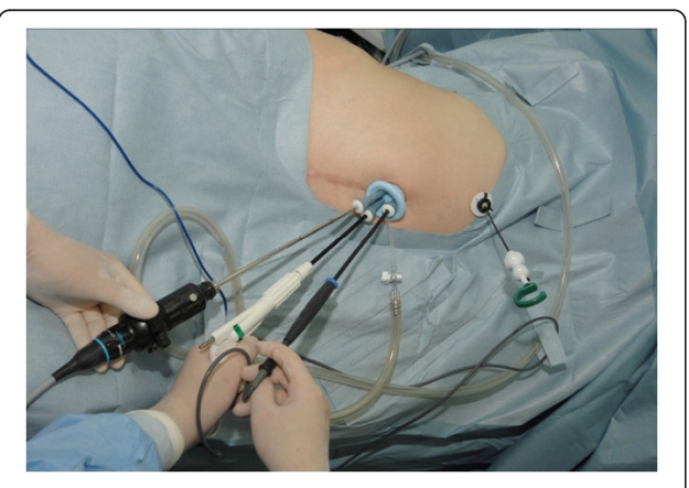
Figure 2 Port placement for right single-port laparoscopic adrenalectomy. The SILS™ port was placed through a 2.5cm umbilical skin incision.

Our patient was placed in the left semilateral position. A 2.5cm incision was made on the umbilicus, and a multichannel port (SILS™ port; Covidien, Mansfield, MA, USA) was inserted (Figure 2). The pneumoperitoneal pressure was maintained at 10mmHg. Three 5mm cannulas were inserted through the SILS™ port. The