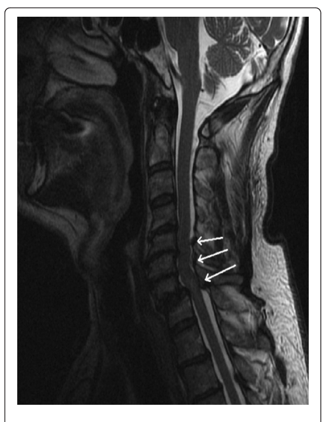
Figure 2 Magnetic resonance imaging of the cervical spine shows a compression of the spinal cord at C5-C6, C6-C7 und C7-T1 (preoperative).

tomography (CT) revealed a spondylolisthesis between C7 and T1. Using the Meyerding classification [8], which was initially developed for grading the degree of lumbar spondylolisthesis, the patient would have been diagnosed with a cervico-thoracic spondylolisthesis of the second or third degree. The spondylolisthesis, measured using the method developed by Kawasaki et al. [9], was 13 mm. In view of the special nature of the case, a collaborative treatment between neurosurgeons and orthopedic surgeons was favored and subsequently implemented.