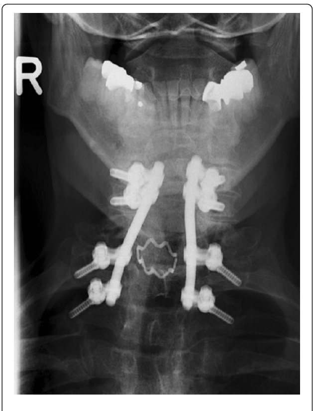
Figure 4 Anterior-posterior radiograph of the cervical spine shows the treatment of the spondylolisthesis at C7-T1; the lower screws were fixed bicortically into the transverse processes of T2 and T3.

Laminectomy is a conventional surgical treatment for cervical myelopathy [10]. It is a quick and easy procedure with minimal blood loss. Its significant disadvantages, however, include the loss of cervical lordosis, a decrease in the range of motion and the possible occurrence of neck and shoulder complaints [11]. It has been shown that compression of the spinal cord occurs in the articular segment rather than in the intraosseus segment. A segmental partial laminectomy may, therefore, be sufficient to reduce the loss of cervical lordosis [12]. A posterior stabilization at the time of the original decompressive procedure [13] may present another way to prevent the development of a kyphotic deformity. For the treatment of spondylolisthesis, posterior stabilization alone does not provide adequate stabilization. An anterior fusion, using a Harms basket filled with autograft bone, provides the highest degree of stabilization [14]. Posterior stabilization was necessary as a laminectomy and resection of the lateral masses of C7 and C8 was determined to be the safest method to decompress the spinal cord and the C7 and C8 nerve roots. A Harms basket was placed ventrally to increase the stability of the fusion and to avoid fatigue of the posterior stabilization.