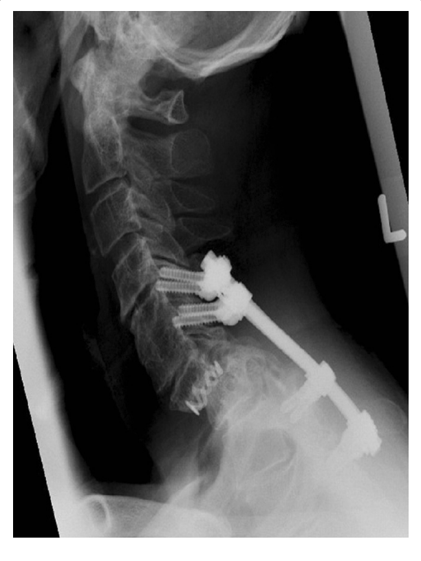
Figure 3 Lateral radiograph of the cervical spine shows the treatment of the spondylolisthesis at C7-T1.

functions can be significantly delayed or may not occur at all.