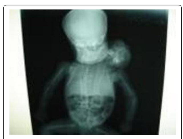
Figure 2 A plain X-ray of the twins showing two separate spines.

The head with normal calvaria contained a well-formed brain whereas the anencephalic head had no forebrain. Two complements of neck organs and two vertebral columns were demonstrable. The right trachea continued to a right-sided pair of normal lungs while the left trachea joined a pair of collapsed and hypoplastic lungs. A single intestinal tract opened to the exterior as a well-