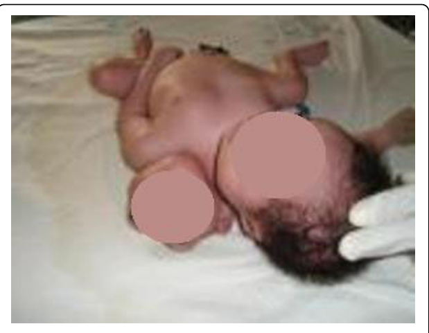
Figure 1 The conjoined twins with discordant heads.

cranium. Each cranium was connected via a separate spine that terminated abruptly at the fifth lumber vertebrae with no evidence of any sacral component (Figure 2). The ribs on the medial side of each twin were fused with each other creating 12 instead of 24 posterior ribs, but the other ribs had not fused. Each upper limb and clavicle appeared borne by the twin on that side.