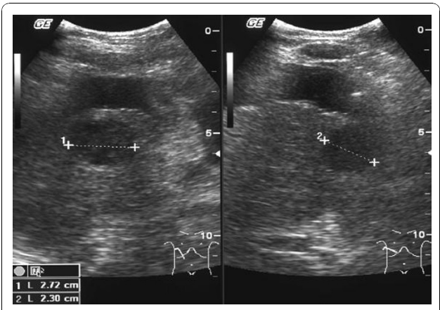
Figure 1 Hypodense lesion (27 × 23 mm) in ultrasound.

A 52-year-old Caucasian female patient had liver cirrhosis Child-Pugh C from Wilson's disease. She came to the hospital because of abdominal pain and ascites. During hospitalisation the patient was evaluated and listed for liver transplantation. Two weeks later oesophageal variceal bleeding and spontaneous bacterial peritonitis occurred, leading to a hepatorenal syndrome with increasing lactate. Therefore, the patient was transferred to the intensive care unit. An abdominal ultrasound and the following CT scan showed new hypodense lesions (Figure 3). One month after hospitalisation the patient