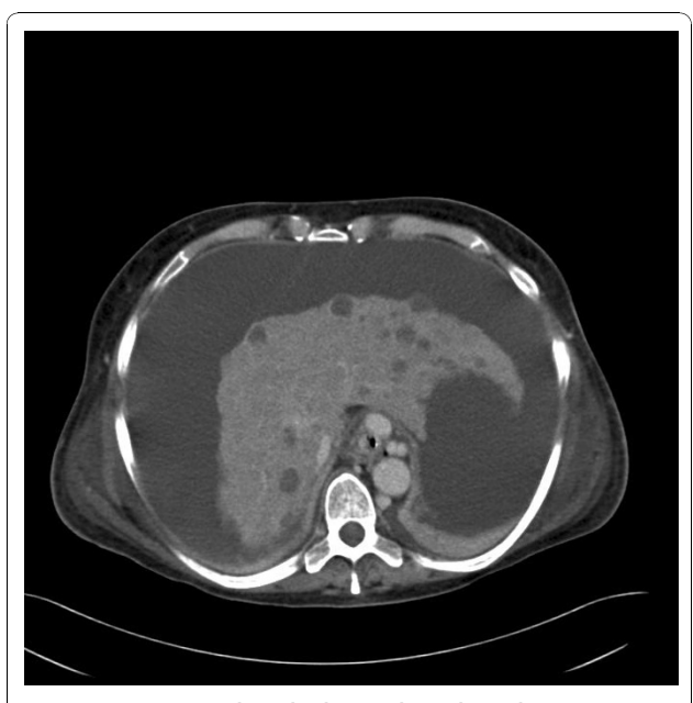
Figure 3 CT scan with multiple new hypodense lesions.

The third patient, a 60-year-old Caucasian male with liver cirrhosis Child C, was admitted to the emergency room because of a collapse and hematemesis. On endoscopy, bleeding gastric varices were observed. Since bleeding was not stopped during endoscopy the patient received a TIPS (transjugular intrahepatic portosystemic shunt). In addition, spontaneous bacterial peritonitis was diagnosed. Two days after the TIPS was placed, an abdominal ultrasound was performed showing an isoechogenic lesion with a 2 cm diameter. During this time,