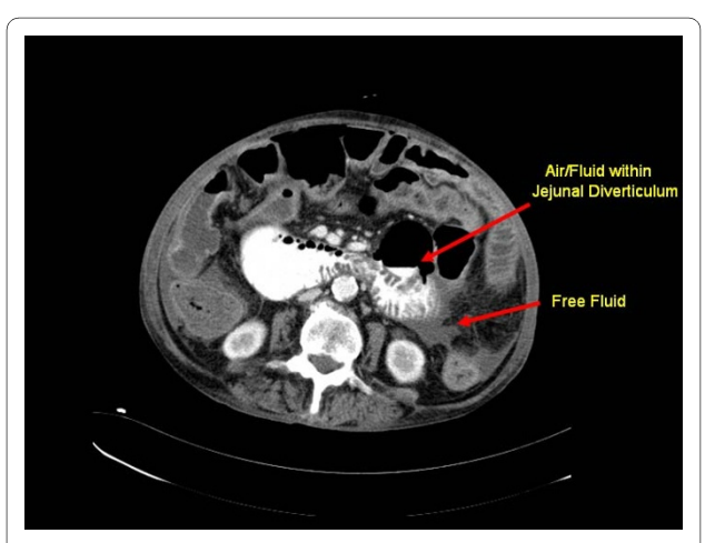
Figure 2 CT scan of abdomen showing thickening of the duodenum and dilatation of the proximal jejunum. Multiple small bowel diverticula were identified with surrounding pockets of free air and fluid adjacent to the jejunal diverticula suggestive of a small bowel perforation.

Usually, this disorder is clinically silent until it presents with the complications associated with diverticular disease. When symptomatic, patients may describe a vague, chronic abdominal pain of varying severity, localized either to the epigastrium or peri-umbilical region. The