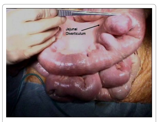
Figure 4 Intra-operative images of dilated loops of jejunum with multiple jejunal diverticula.

Jejunal diverticulosis is a challenging disorder from a diagnostic perspective, with no truly reliable diagnostic tests. Abdominal radiographs and/or chest radiographs may demonstrate evidence of perforation, such as free air under the diaphragm or free peritoneal air; evidence of intestinal obstruction, or evidence of ileus, including multiple air-fluid levels and bowel dilatation. CT may identify thickening or inflammation of the jejunum or localized abscess formation [7,8]. Endoscopic procedures, such as double-balloon enteroscopy and capsule endos-