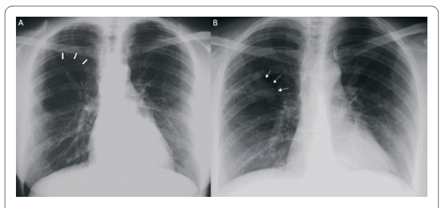
Figure 1 (a) Posteroanterior chest X-ray showing an area of overinflation and parenchymal oligemia downstream at the right upper lobe (thick arrows). (b) Posteroanterior chest X-ray showing right parahilar superimposed opacity (thin arrows).

examinations (Figure 1). A multi-detector computed tomography (MDCT) scan of the lung was performed before and after intravenous non-ionic contrast medium administration and confirmed the over-inflation of the posterior segment of the right upper lobe with an atretic segmental bronchus, partially filled with mucus. Bronchoalveolar lavage, sputum and bronchial aspirate were negative for malignancies. Fiber-optic bronchoscopy confirmed stenosis of the bronchus of the posterior segment of the right upper lobe, and a diagnosis of BA was established. Symptoms and clinical history were then attributed to the discovered BA. High resolution computed tomography (HRCT) allowed this lesion to be better characterized, and another area of over-inflation with multiple air cysts connected to the segmental bronchus and well demarcated from normal lung parenchyma was detected in the apical segment of the right lower lobe. These findings were characteristic of CCAM type I (Figure 2) and the diagnosis was confirmed by biopsy (Figure