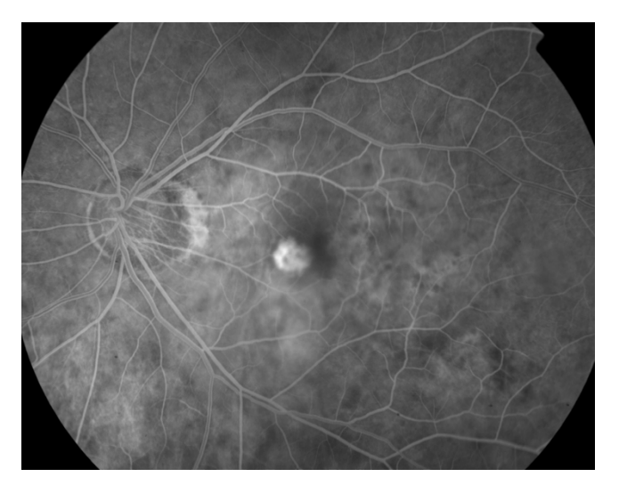
Figure 2 Early phase fundus fluoroscein angiogram showing choroidal neovascular membrane with well defined hyperfluorescence.

After considering discussion of various treatment options, the patient decided to proceed with 0.5 mg of intravitreal ranizumab (Lucentis). One month following intravitreal injection into the left eye, her visual acuity improved from 6/32 to 6/12. OCT and FFA showed no subretinal fluid and furthermore regression of CNVM complex (Figure 3). However, the patient still complained of distortion and that the images are still smaller and darker in the left eye compared to the right eye.