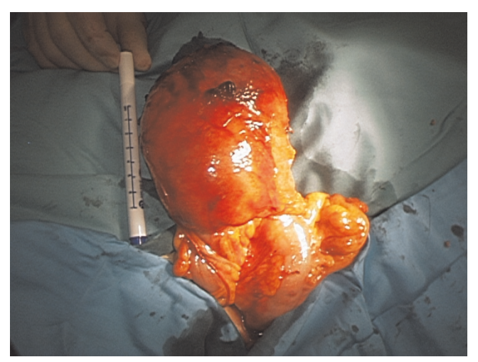
Figure 3. Externalised sigmoid colon and anti-mesenteric giant cyst.

Macroscopic assessment of the segmental colonic resection confirmed the presence of diverticular disease with an associated giant cyst measuring 11cm in maximal