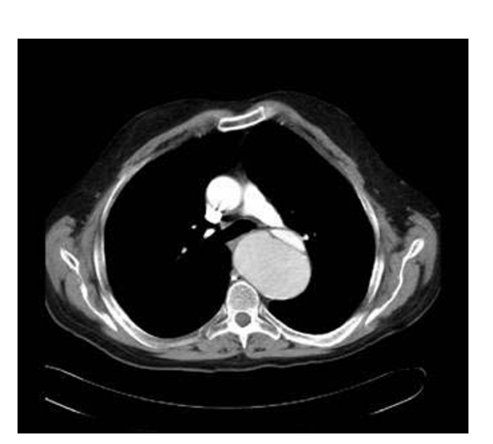
Figure 1 CT scans demonstrating the dissection at the level of the aortic valve.

An immediate opinion was sought at the regional cardiothoracic unit and the patient was transferred urgently under their care. A transthoracic echocardiogram was performed which confirmed the CT findings demonstrating turbulent flow in the ascending aorta suggestive of an intimal tear in the region although the lesion itself was not seen. The arch was mildly dilated but with no visible flap.