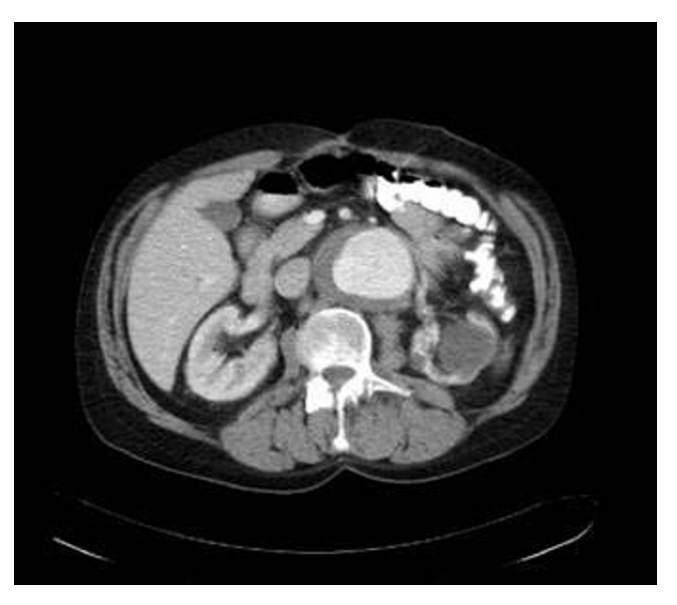
Figure 2 CT scans demonstrating the dissection at the level of the coeliac axis.

Flow in the descending aorta was turbulent in the initial 2–3 cm suggesting intimal disruption.