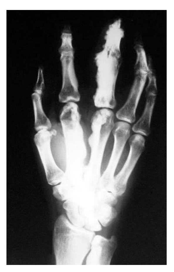
Figure 3 There is massive sclerosis over the second and third digits (carpo-metacarpo-phalangeal). The sclerosis extends to involve the distal and middle phalanges of 4th digit as well as the carpal bones.