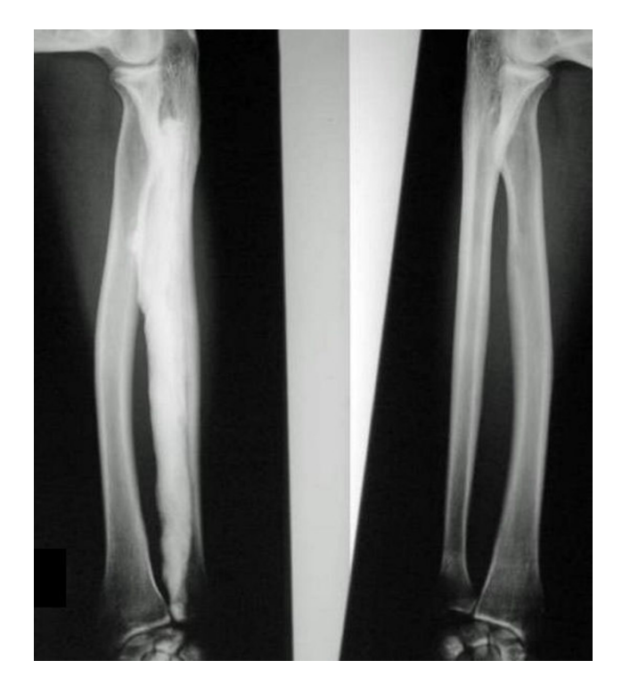
Figure 2 Radiograph of the forearms showed, typical cortical thickening, mostly along the right radius, massive extensive thickening and sclerosis extends along the carpal bones respectively. There was mild sclerosis of the ulnae with bowing; similarly the radius on the left side is also mildly sclerotic.

Blood biochemistry revealed moderate hypercholestrolaemia, and the triglycerides showed mild elevated levels. Serum calcium, phosphorus, and alkaline phosphatase levels were normal. Endocrinological examination of the thyroid hormones, PTH, and adrenocorticotropic hormones showed no abnormalities. Our patient underwent a genetic investigation of the LEMD3-gene; Genomic DNA was extracted from the whole blood samples and polymerase chain reaction (PCR) was performed to amplify the 13 exons and flanking intronic regions of the LEMD3-Gene (primer sequences are available on request). The PCR products were analysed by direct sequencing (MWG Biotech G, Ebersberg, Germany). We were unable to detect any mutations in the 13 exons and flanking intronic regions of the LEMD3-gene in our patient (NCBI reference sequence: NC-000012).