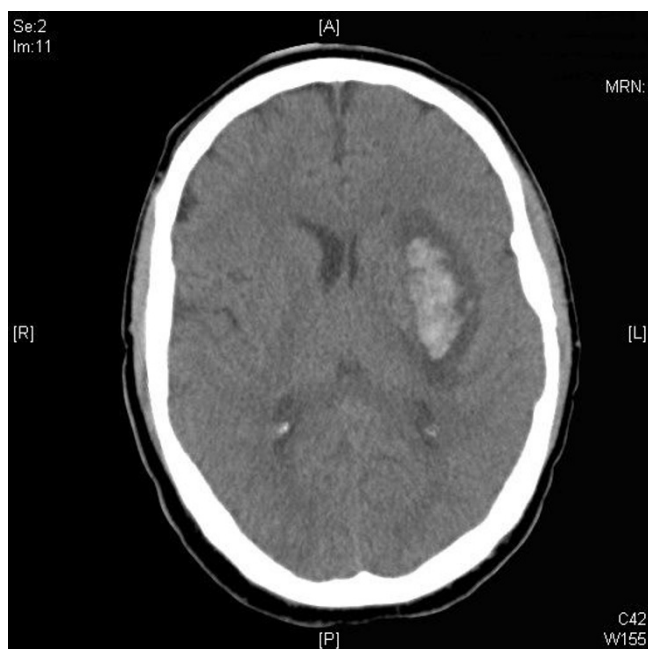
Figure 3 Computed tomography scan of the head demonstrating left internal capsule haemorrhage.

dysphasia and his renal function improved enough not to need renal replacement therapy. One year later he remains well and dialysis-independent with a serum creatinine of 295 \mu\text{mol/l} , but has continued taking oral prednisolone 10 mg once daily, a dose which is gradually being reduced. His PCR has improved to 87 and urine dipstick has remained positive for blood 1+ and protein 1+.