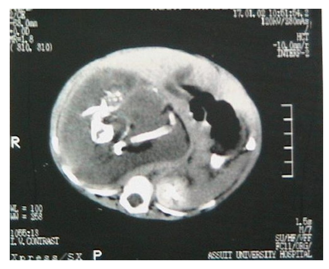
Figure 2 Computed Tomography scan of the patient's abdomen reveals a large retroperitoneal soft tissue mass. There are long hyperdense opacities that resemble fetal bones (see arrows)