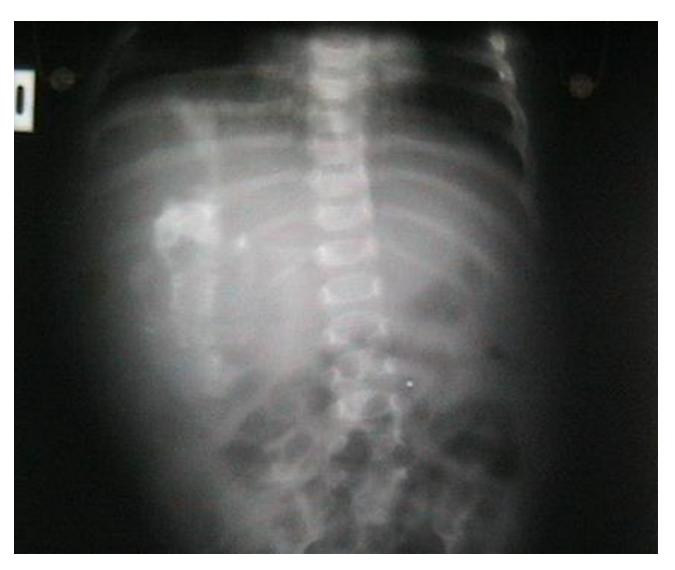
Figure I Anteroposterior abdominal radiograph demonstrates a soft tissue mass in the right hemiabdomen. The mass contains calcified osseous-appearing structures of varying sizes and shapes (see arrows)

After four years our patient has shown no recurrence or complications and is leading a completely normal healthy life.