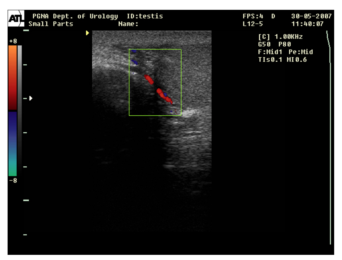
Figure 1 Color Doppler Ultrasound of the right hemiscrotum showing normal testicular parenchyma and blood flow.

intermittent testicular torsion, e.x "bell clapper" deformity of the testis, or torsion of testicular appendages.